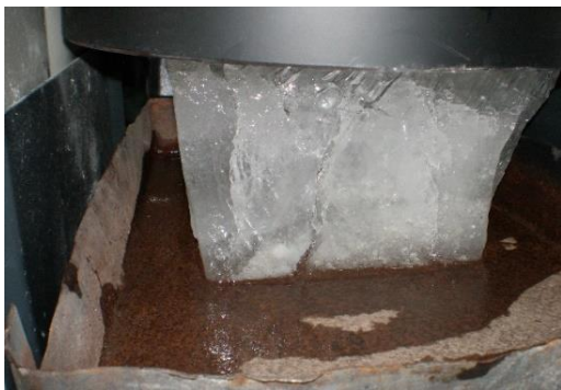
Fig. 1 Determination of the strength of an ice sample

The methodology presented in the literature for calculating ice loads determined by the strength tests of ice samples [1] has been determined by the specific dimensions and laboratory tests.